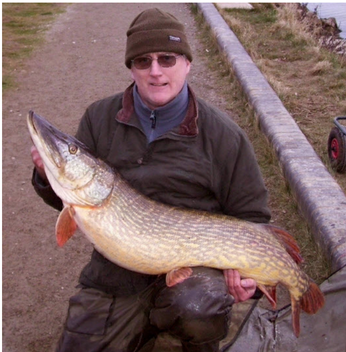
Anonymous 46lb Unknown water. Feb 2007